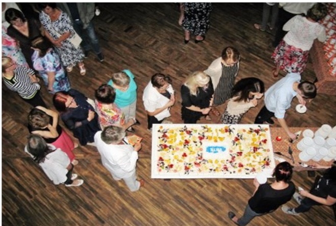
Members queuing up for the EATE anniversary cake.