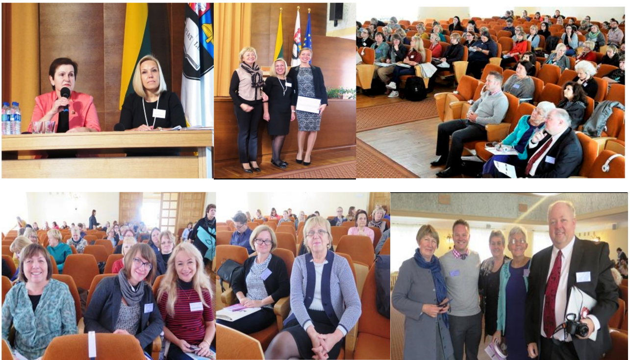
Photos from the EEA Grants project "Modernisation of Multicultural Education Methods for Pre-school and Pre-primary Level" conference.

The common work of the international team of teachers, teachers trainers, education support specialists and linguists resulted in the project publication - "Multicultural Kindergartens. Good Practice Guide", which was presented to the participants of the closing conference. The Guide covers a range of relevant topics: early multicultural education in kindergartens, its tasks and challenges; kindergarten community, cooperation with parents and ethnic minorities; tips on learning languages; education support. The presented best practice and case studies can be used for professional development by teachers working in a multicultural and multilingual environment/ The Guide offers a bank of on-line resources - games, films, educational activities, audiorecordings - that can be used in the kindergarten or at home. The e-version of the Guide is available at https://issuu.com/vikc.lt/docs/gerosios_praktikos_vadovas