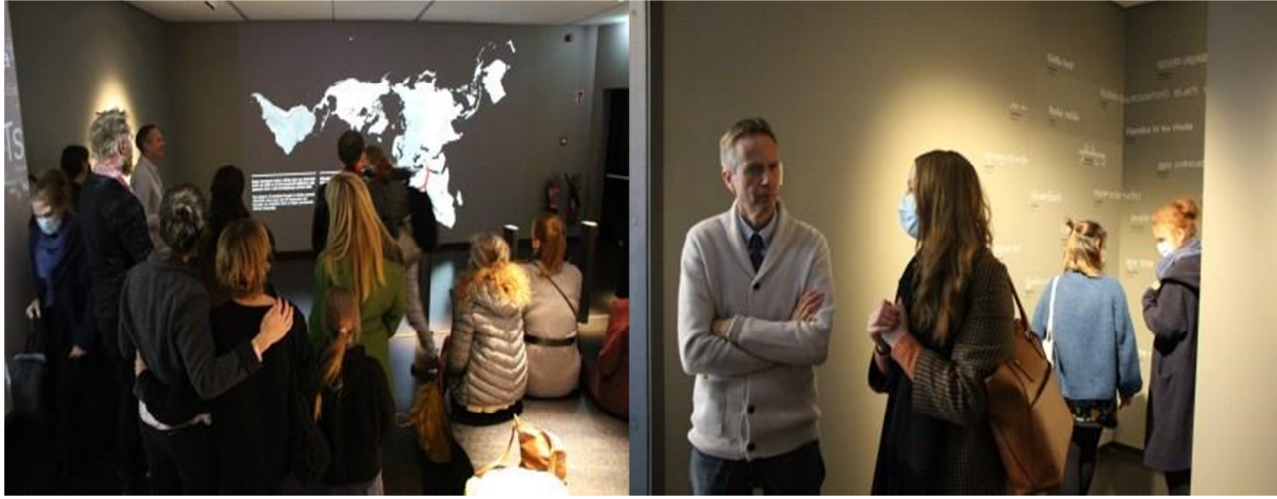
(Photgraps from the European Day of Languages event)