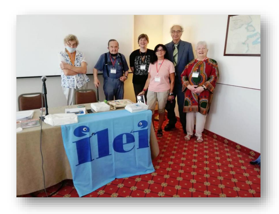
Photo 1: The presentation of the project during the Italian Esperanto Congress 2022

project called the "30 Golden Hours". As the readers certainly know, Esperanto is an international auxiliary language developed to help world peace by facilitating dialogue on an equal basis. The project itself concerns teachers currently working in Italian schools and it is based on the idea that Esperanto is perhaps the only language easy enough to be taught even without extensive studies and preparation. As examples in different countries show, it can even be taught while one learns it. Therefore, just after a free video course of 20 hours on the language and its culture (literature, history, music, animation, etc.), plus 10 hours of individual study, a high school teacher is fully equipped to teach Esperanto to her own students. Moreover, apart from learning the language itself, students could also develop metalinguistic abilities that might prove useful in deepening their grasping of other languages and of their own.